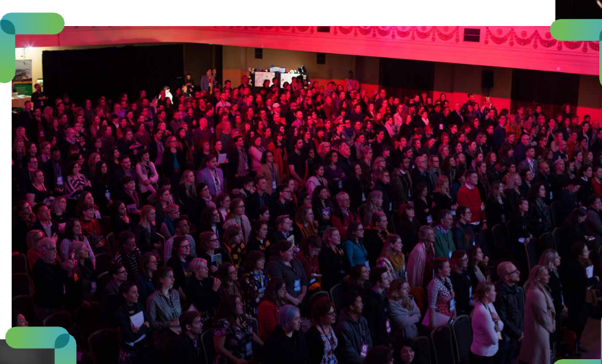
Progress, our flagship conference, returned to the historic Melbourne's historic Town Hall and Athenaeum Theatre, June 6 & 7, 2017. »